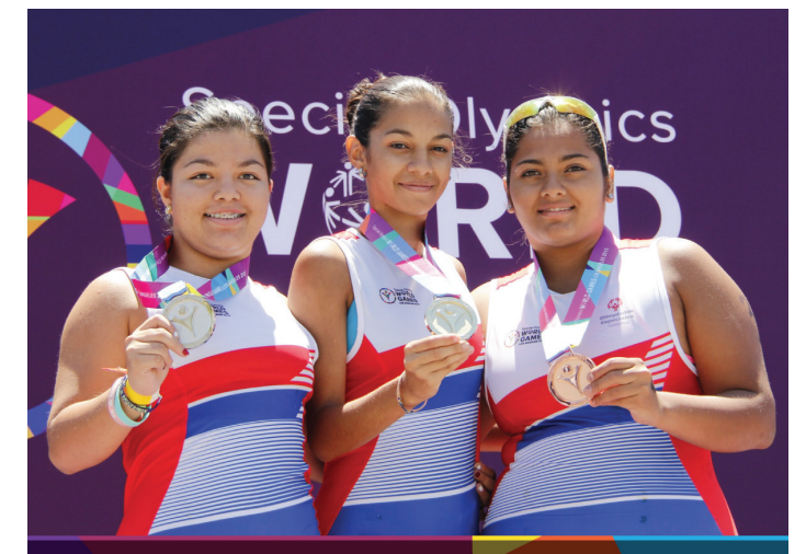
Tune into ESPN to catch the LA2015 Special Olympics World Games Daily Recap!